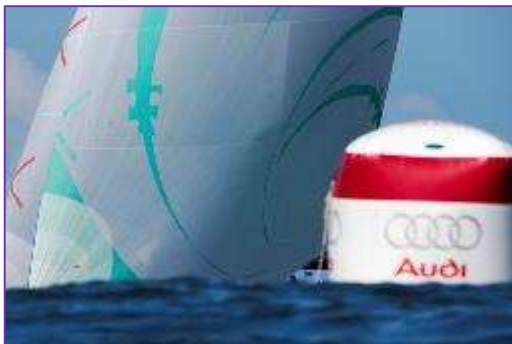
Racing at Audi IRC Australian Championship 2014