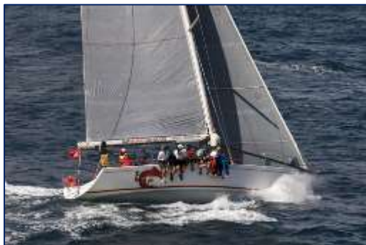
Nine Dragons, Division B winner