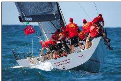
Team Beau Geste, Division A winner.

The location for the 2015 IRC Australian Championship is yet to be announced.