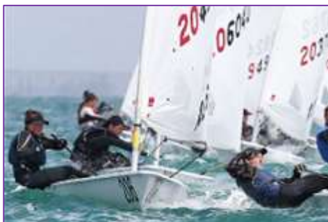
Australian Youth Championships images courtesy B Malone Photography

The 2015 Australian Youth Championships will be hosted by Fremantle Sailing Club from 6-10 January 2015.