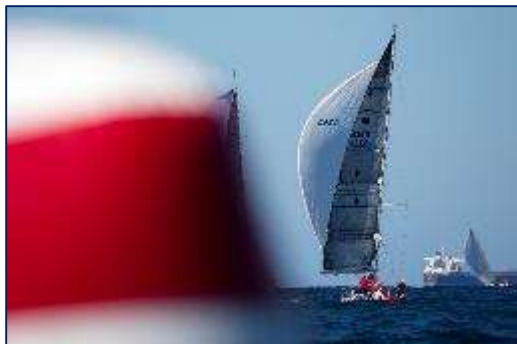
Wild Rose, Division B winner