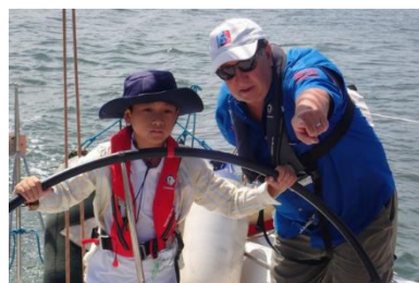
Sailors with disABILITIES - Winds of Joy Melbourne Winner of Inclusion Program of the Year